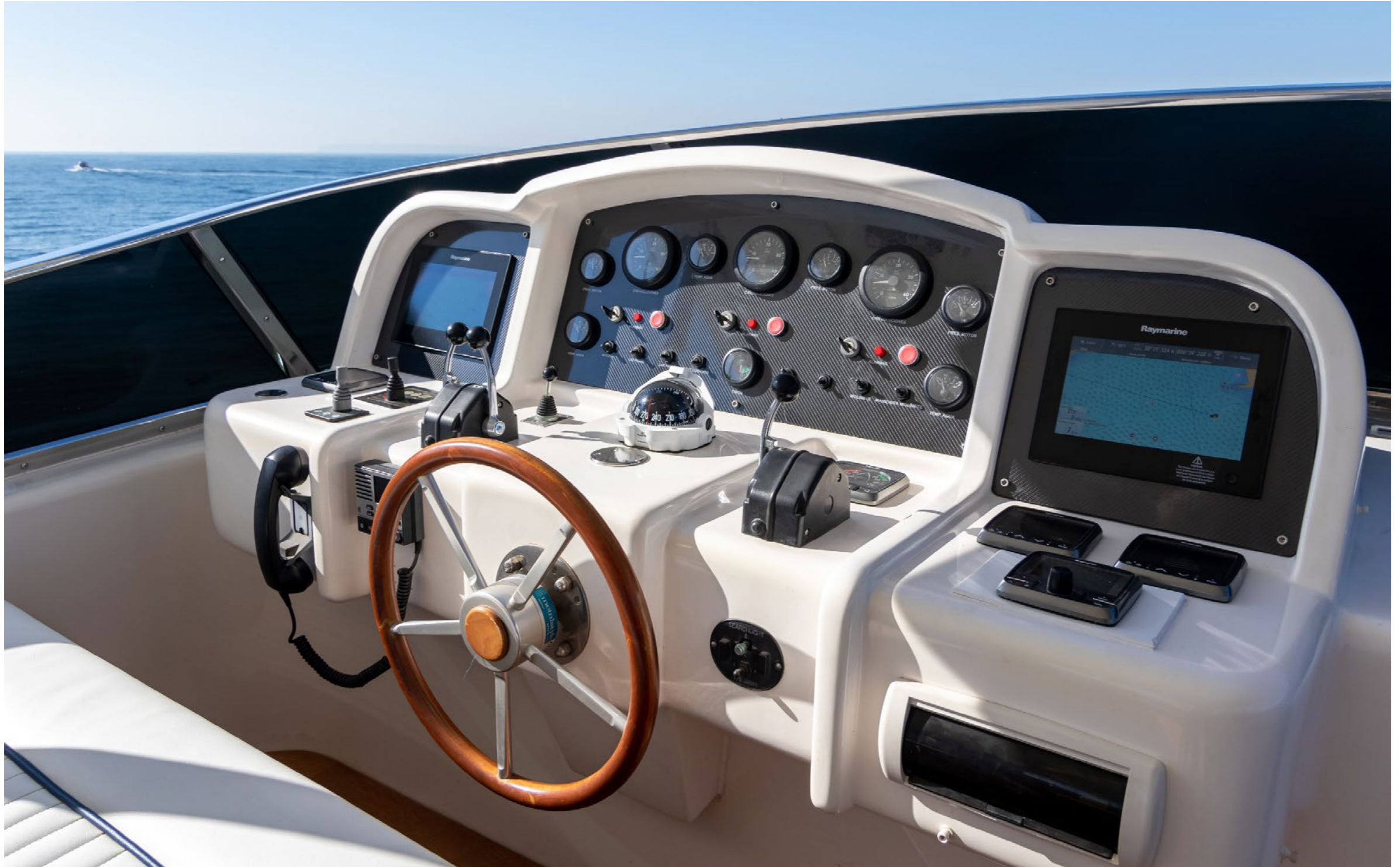
SUN DECK HELM STATION