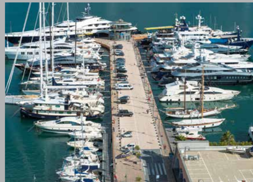
Parking slots on the jetties