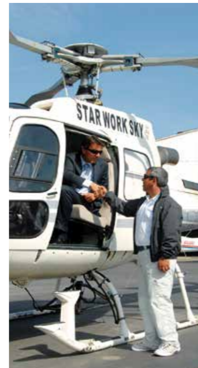
Air and Helicopter taxi