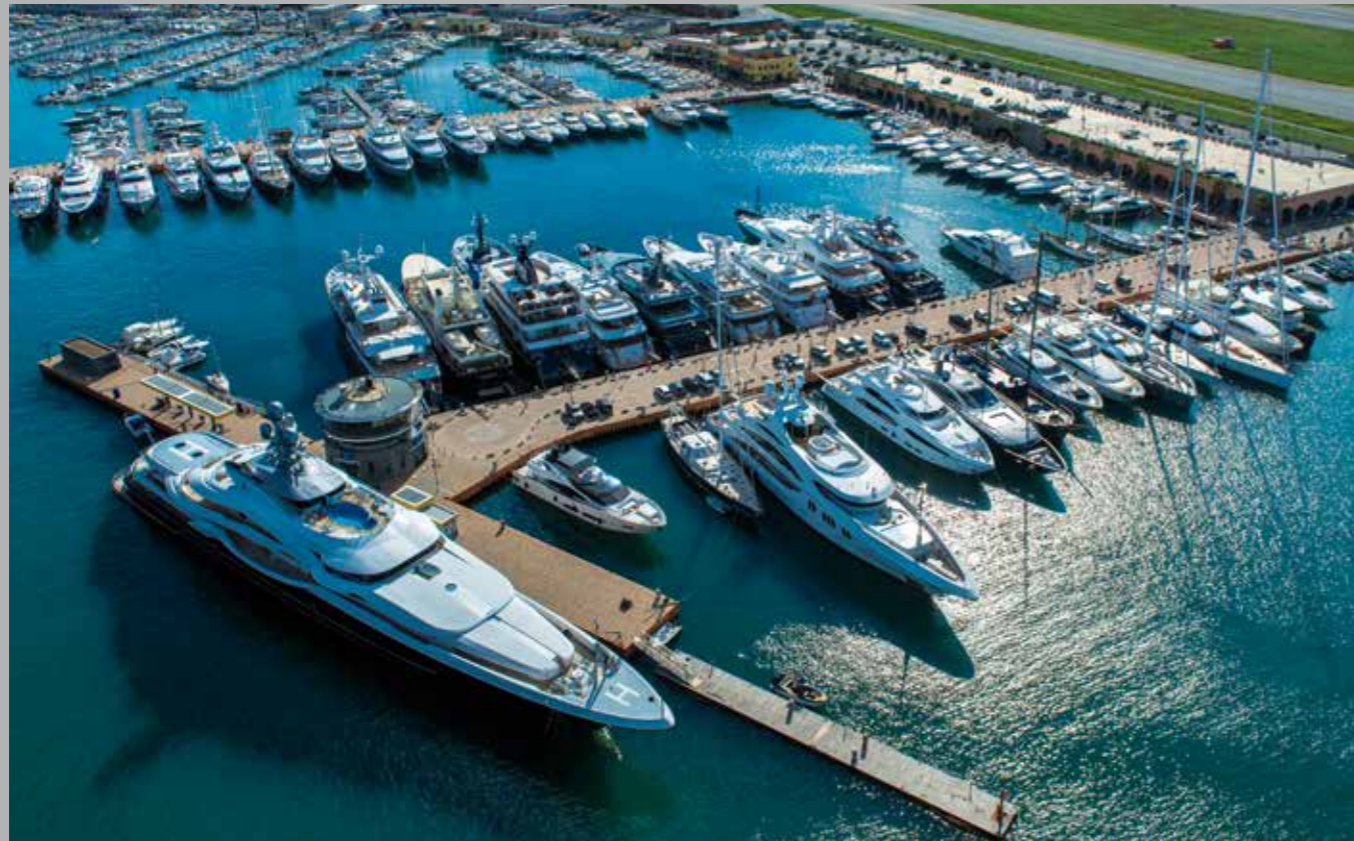
M/Y Atessa IV – 101 mt - on alongside berth

State of the art shipyards nearby, on site expertise in refitting, repairs and maintenance , all facilities on your fingertips. A strong network of contractors at hand. Superior quality Yacht Provisioning Bunkering Chandlery, Mega Yacht technology, accessories and spare parts Fully qualified skillful Marina Staff always on hand to give total support for routine and specialized yachting operations