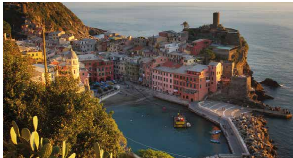
5 Terre, Vernazza

"With the French Riviera almost impossible to find a mooring. MGA is well positioned with Corsica, Monaco and Portofino a short cruise away not forgetting the International Airport on her doorstep"