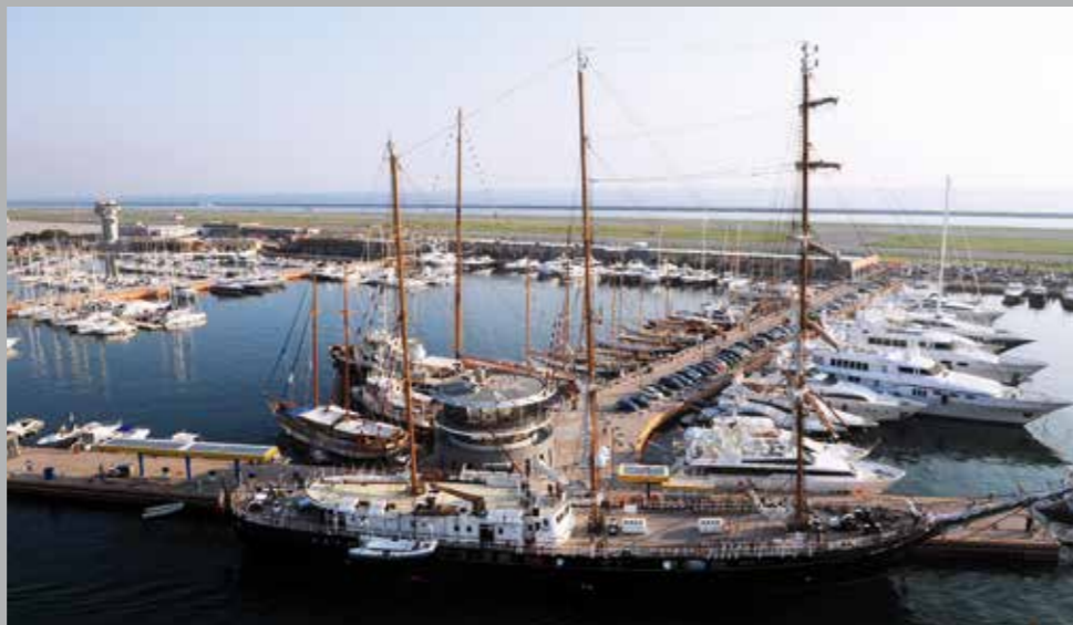
S/Y Signora del Vento - 85 mt

"Super easy, clean, safe... it's a definite option for the future." Captain M/Y Talitha G