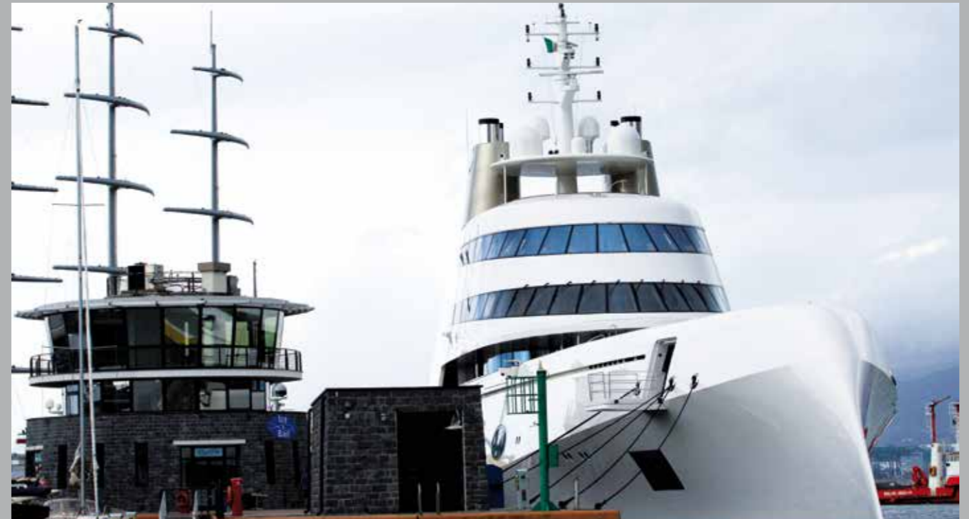
M/Y A - 119 mt - at fuel dock

"Super easy, clean, safe... it's a definite option for the future." Captain M/Y Talitha G