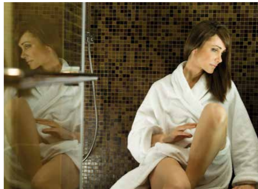
Steam Room in MarinaPlace Suite

Yacht registration and management services, professional cleaning, day workers, repairs, port bookings, hotel, accommodations and leisure reservation, shopping facilities, car rental & shuttle service, air and helicopter taxi, and moreover laundry services, express courier, flower arrangements, medical assistance, weather reports and anything else to make your life on board seamless.