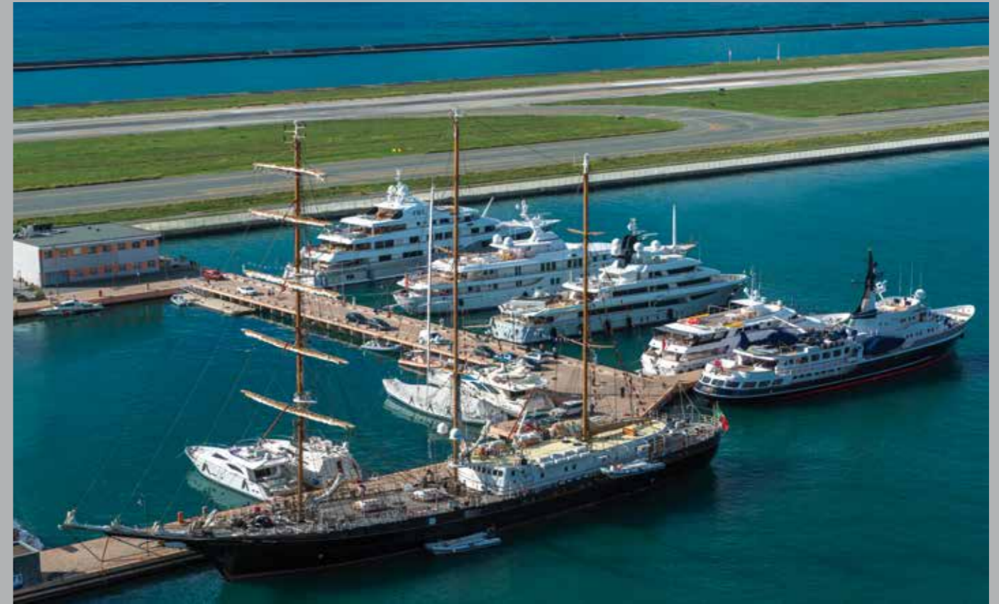
Private Quay W