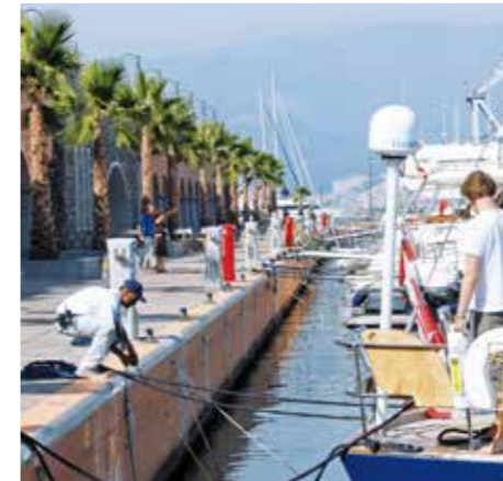
24/7 mooring assistance