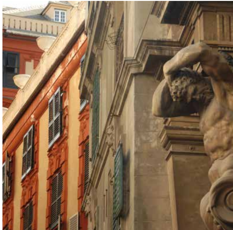
Genoa, Via Garibaldi

Liguria, a region full of surprises with such pearls as Genoa, Portofino, and the Cinque Terre - real treasures of artistic, natural and scenic beauty which together synthesise the true character of the region.