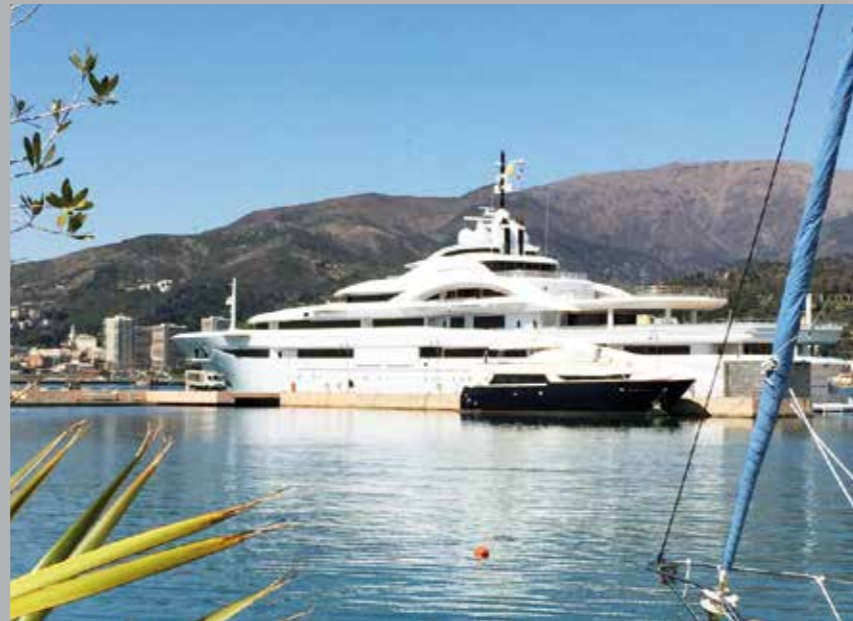
Private Quay Y